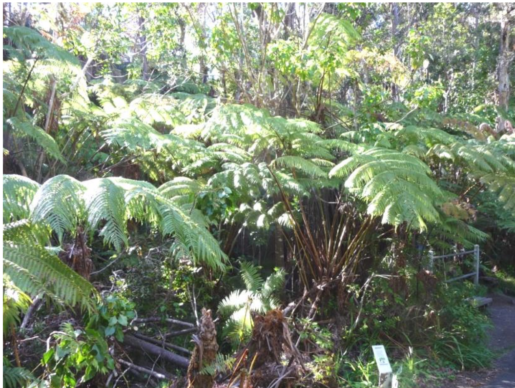
Hapu'u pulu (hay-pu-u pu-lu) Cibotium glaucum

This fern grows in mesic to wet forests and is usually found at higher elevations than the other Hawaiian species. Fiddleheads of this tree fern are covered with absorptive pulu (wool) that protects its new growth from drying. Soft pulu is also useful as a dressing for wounds and abrasions.