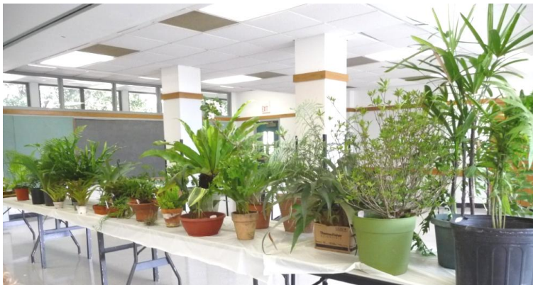
Lovely display of plants to swap