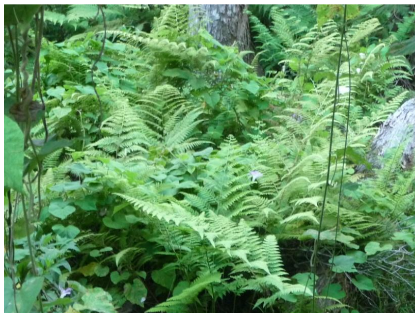
Palapalai (pa-la-pa-lie) Microlepia strigosa

This fern grows in mesic to wet forests and is usually found at higher elevations than the other Hawaiian species. Fiddleheads of this tree fern are covered with absorptive pulu (wool) that protects its new growth from drying. Soft pulu is also useful as a dressing for wounds and abrasions.